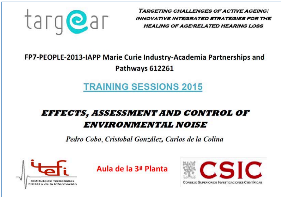
Figure 1. Call poster for the TARGEAR Training Session at the ITEFI, 18 June, 2015